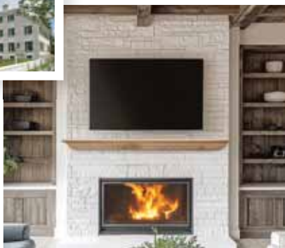
CUMBERLAND SHAKER CRAFTSMANSHIP