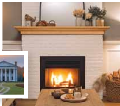
MADISON ARCHITECTURAL DIVERSITY