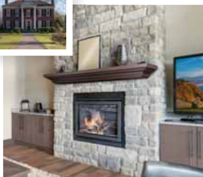
WOODFORD HISTORIC ESTATES