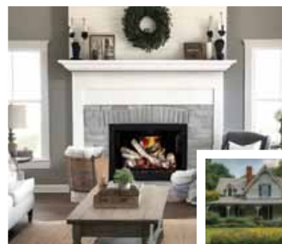
PENDLETON FARMHOUSE HERITAGE