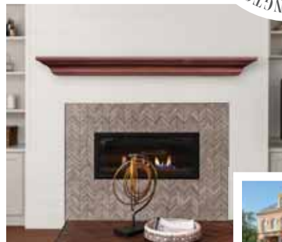
KENTON SOUTHERN + URBAN

The Commonwealth Collection honors Kentucky's architectural legacy with a distinctive line of mantels and shelves, each inspired by the character of a Kentucky county. From Georgian refinement and Federal detail to Victorian charm and modern minimalism, these designs reflect centuries of evolving style.